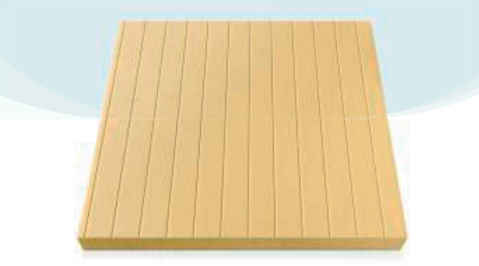
FINE GROOVE SURFACE